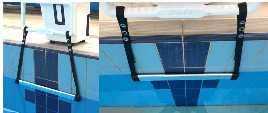
BackStroke Ledge Installation and Use